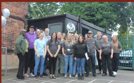
YMCA SUTTON COLDFIELD