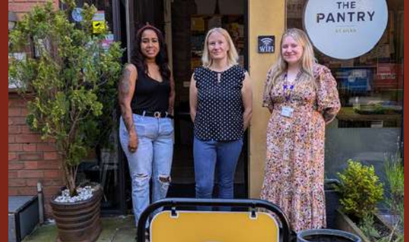
ST GILES PANTRY COVENTRY St Giles Trust