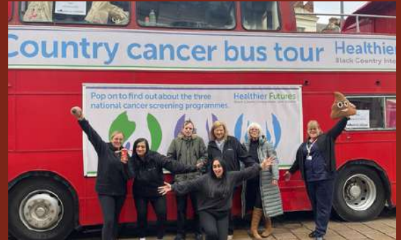
BLACK COUNTRY ICB CANCER TEAM Black Country Integrated Care Board