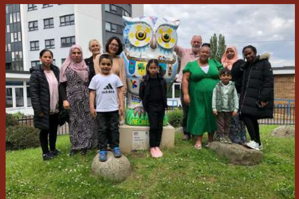
NECHELLS POD SHINE@NechellsPOD