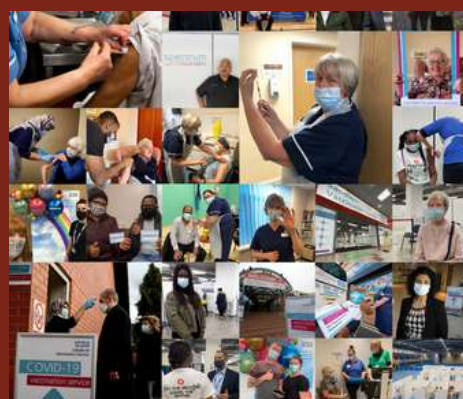
BLACK COUNTRY ICB COMMUNICATIONS TEAM Black Country ICB