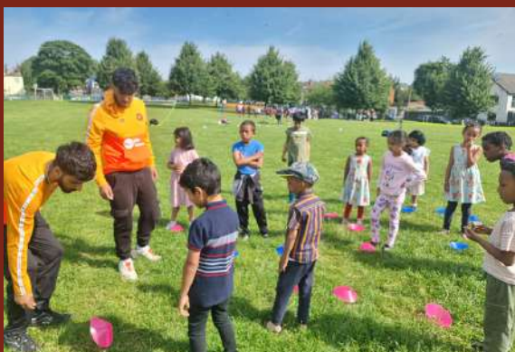
WARWICKSHIRE CRICKET FOUNDATION