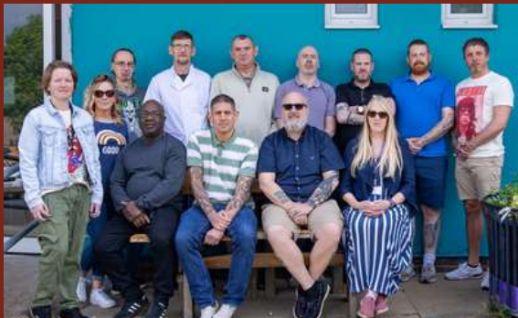
A BETTER TOMORROW