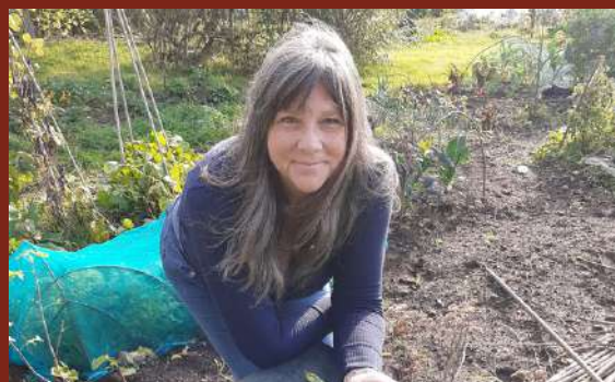
HERITAGE SEED GUARDIANS Garden Organic's Heritage Seed Library