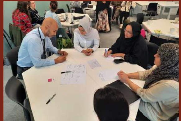
WOMEN ACTING IN TODAY'S SOCIETY