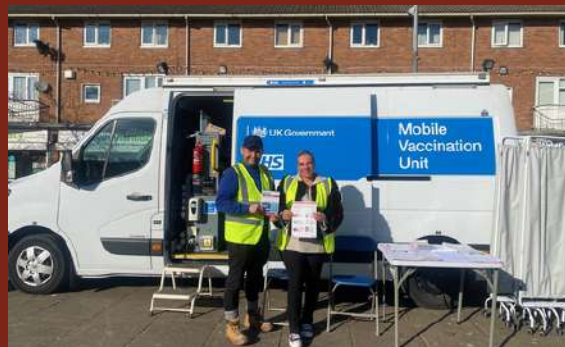
CENTRAL HEALTH SOLUTIONS (VACCINATION TEAM)