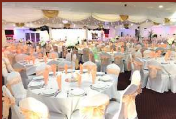
SEVEN STARS EVENT LTD