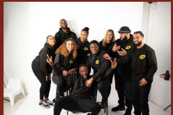
VISION FOR ALL