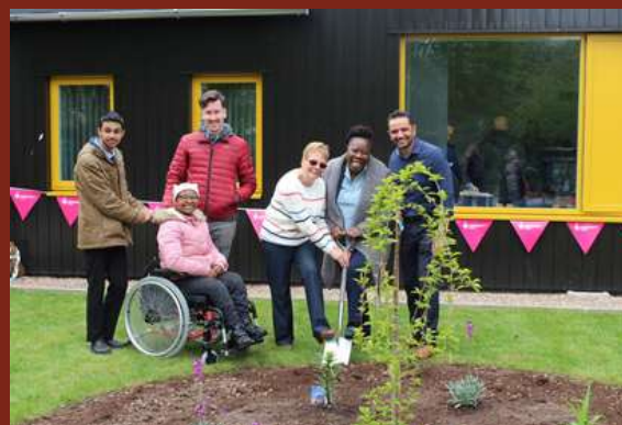
WELLBEING OUTCOMES FRAMEWORK PROJECT TEAM