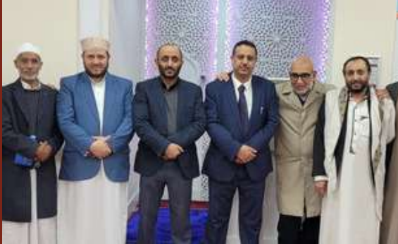
HALESOWEN/DUDLEY YEMENI COMMUNITY ASSOCIATION