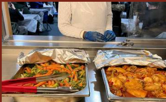
VILLA CROSS SOUP KITCHEN