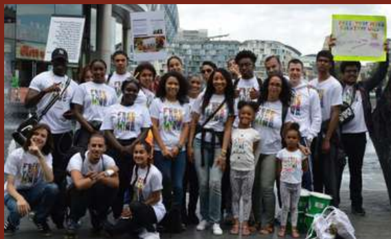
FREE YOUR MIND CIC