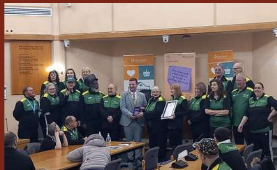
SPECIAL OLYMPICS SANDWELL

Evolve and City of Birmingham Hockey Club