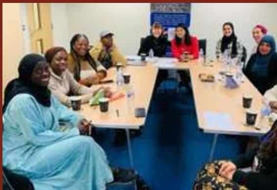
COMMUNITY CONNEXIONS Birmingham Community Healthcare NHS Foundation Trust