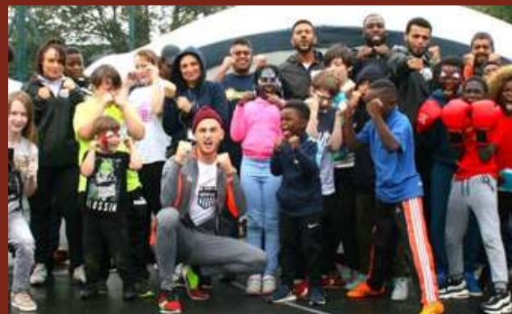
HOPE COMMUNITY PROJECT (WOLVERHAMPTON)